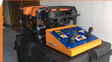
AOS Delta ROV